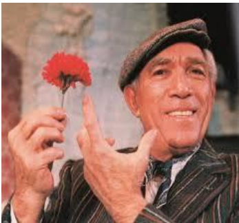
4. Zorba the Hunchback?