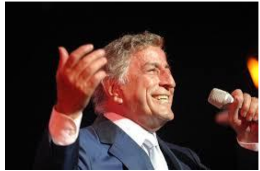
3. Wants to fly to the Moon