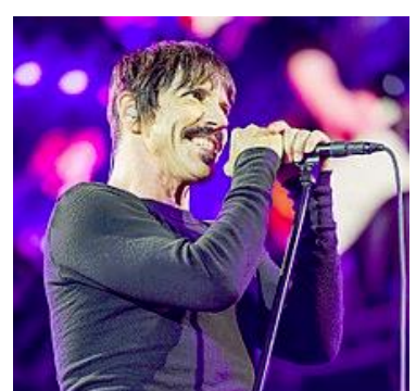
11. Red hot, and chilly.....