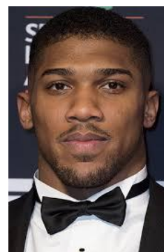
10. Bad for Vlad