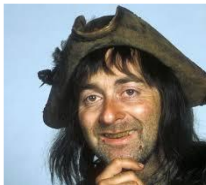
9. Had a cunning plan