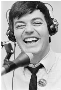
13. The 1 st on 1