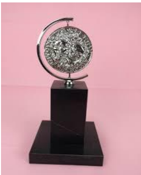
8. All the World's a stage