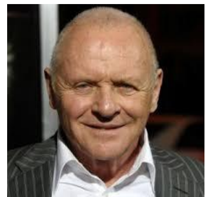
15. Likes liver, fava beans & Chianti