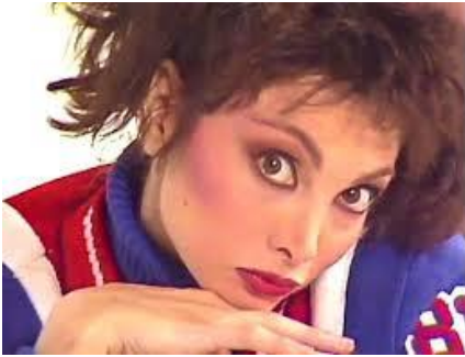
1. Liked Mickey