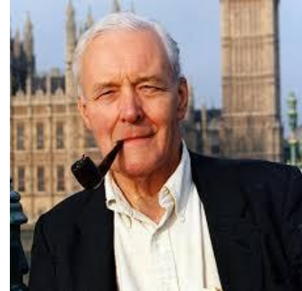
6. Pipe Smoker of the Year 1992