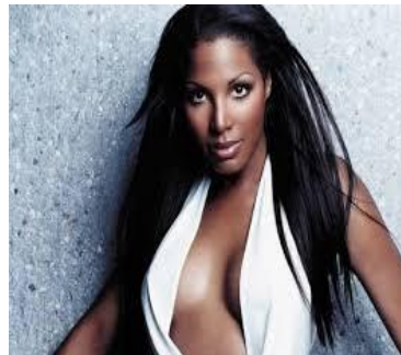
5. Un-break her heart