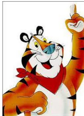
14. He's GRRRRREAT