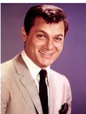
12. Some liked it hot