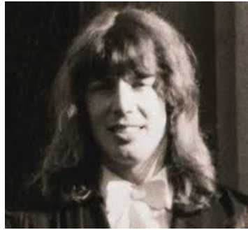
2. Guitarist for Ugly Rumours