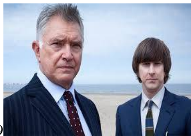
9 2007- present