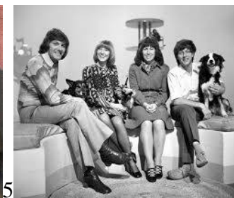
5 1958- present