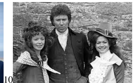
10 1975-77, remade 2015