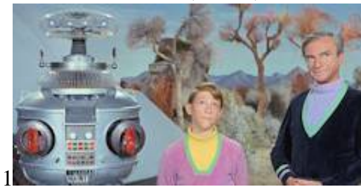
1 Late 1960's